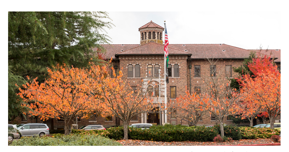
Western State Hospital main entrance

Washington's two primary psychiatric treatment facilities — Western State Hospital and Eastern State Hospital — were built more than a century ago. As demand for behavioral health treatment services has grown in recent